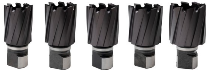
1" CUTTER 1-1/16" CUTTER 1-1/8" CUTTER 1-3/16" CUTTER 1-1/4" CUTTER