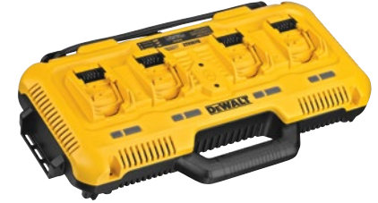
FAST CHARGER - 4 PORT