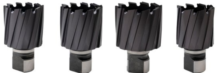
1-5/16" CUTTER 1-3/8" CUTTER 1-1/2" CUTTER 32mm CUTTER