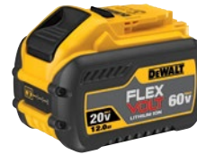
12AH FLEXVOLT BATTERY