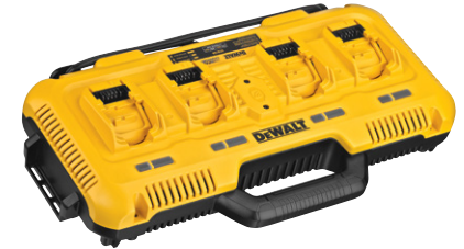
FAST CHARGER - 4 PORT