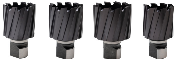
1-5/16" CUTTER 1-3/8" CUTTER 1-1/2" CUTTER 32mm CUTTER