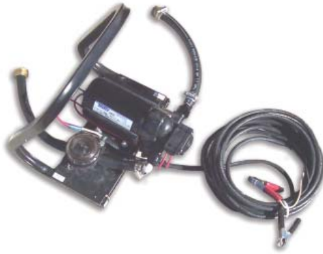
Model DCP30101 Water Pump